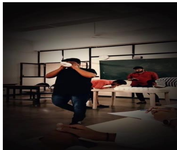
2 nd Year students welcoming 1 st Year Students through Interaction program